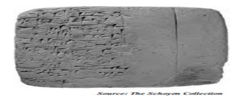
INSTRUCTIONS OF SHURUPPAK:

Sumerian on clay, Sumer, 2,600 BC. This Early Dynastic tablet represents the earliest literature in the world. Only 4 groups of texts are known from the dawn of literature. The instructions are addressed by the pre-flood ruler