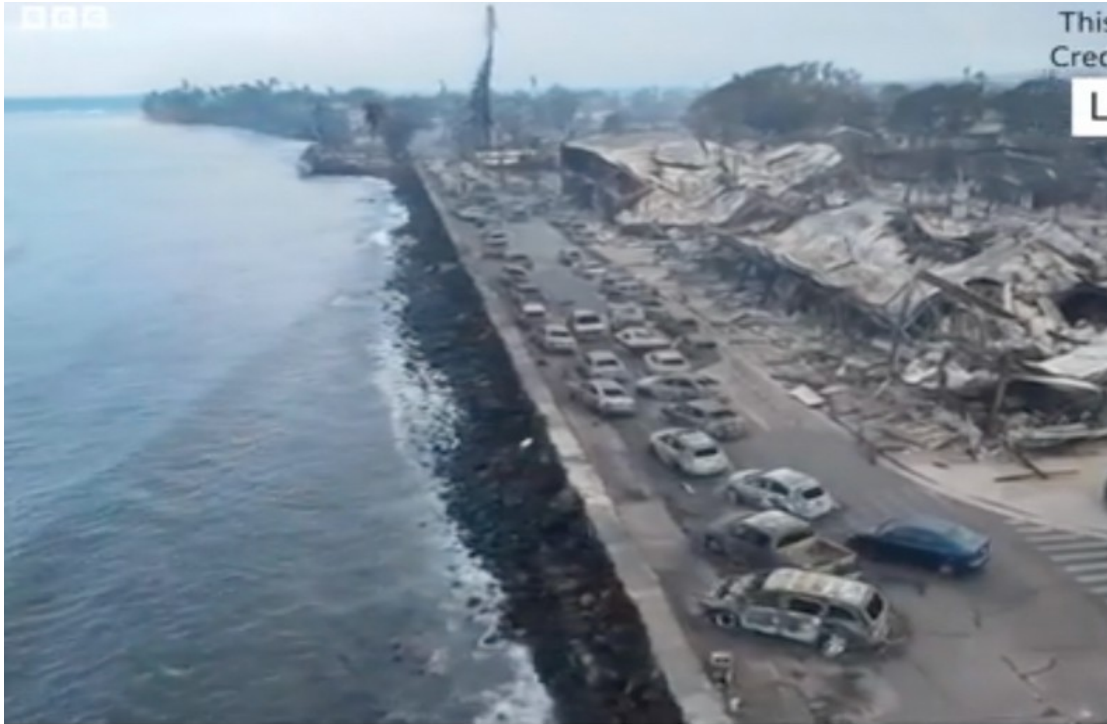
Watch: Extensive devastation left by Maui wildfires

Can you make sense of that photo, for instance? All those people were allegedly incinerated in their cars, not a block or two from the ocean, but SIX FEET from the ocean! And you know what, a DEW doesn't explain it, either. Why not? Because if Lahaina had been destroyed by a DEW, thousands of people would have been incinerated in their homes and businesses. The deaths wouldn't be 100 or even a thousand, they would be 10,000, with most in their homes. All the tourists there would also be dead. Instead we are being told a few hundred may have been incinerated in cars. That makes no sense, because if this was a DEW it didn't just target cars. Most houses and businesses were also turned to white dust. Do you think everyone felt the DEW coming, so they got in their cars? No, again, we go to curtain number three: that film is CGI . I remind you that CGI specializes in exactly this kind of overhead panning of a scene, with little or no motion within it. This was developed for Hollywood, which uses it extensively. They have programs now that turn a normal scene into a disaster scene, almost at the touch of a button.